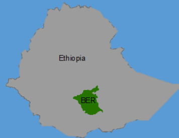
Location of the Bale Eco Region (BER) in Ethiopia

Conservation of Biodiversity and Ecosystems Functions and Improved Well-being of Highland and Lowland Communities within the Bale Eco-Region (BER) is one of the European Union (EU) funded projects that stands for Supporting Horn of Africa Resilience (SHARE). In Ethiopia, the project covers 16 districts (Districts) in West Arsi and Bale Zones of Oromia Regional State, around 22,000 km 2 , with a population of about 3.3 million. The project life span is 42 months starting July 2014 and ending in November 2017. Five partners are implementing the project: Farm Africa, SOS Sahel, International Water Management Institute (IWMI), Frankfurt Zoological Society (FZS) and Population Health and Environment (PHE).