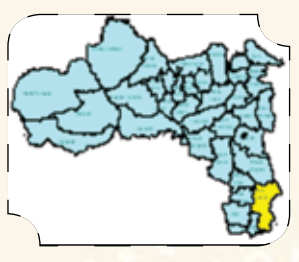
Raya Azebo in Tigray

Raya Azebo is an arid, drought-prone and densely populated woreda in the Southern zone of Tigray. In 2007 it had a population of 135,870 (a 55% increase from 1994), evenly distributed between men and women. 11.8% of this population is urban, and 95% are involved in agriculture<sup>4</sup>. The REST project is implemented in three kebeles: Ebo/Abnet, Bala and Genete, which have a combined population of 20,473. These kebeles, like the Raya woreda itself,