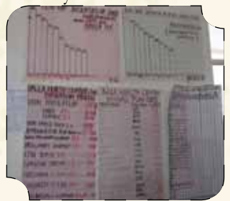
Data collection at Bala Health Center

Sustained momentum: Workshop participants mentioned strong initial momentum to integrate PHE activities, but efforts that fade with time when trainings are not held often. Therefore, continuous follow-up with government and other stakeholders is necessary to maximize project effectiveness.