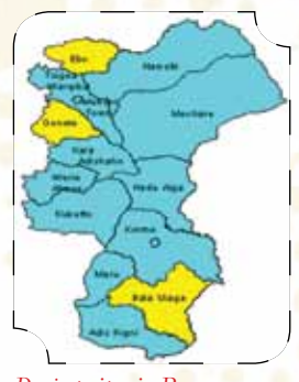
Project sites in Raya

were chosen as project sites because of their relative food insecurity, poverty and vulnerability. Of 114,858 people over the age of five who were surveyed in the woreda in 2007, 81,643 had never attended school<sup>4</sup>. According to 2005