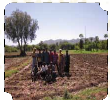
School club members and their garden

Eyob school HIV/AIDS club leader and member