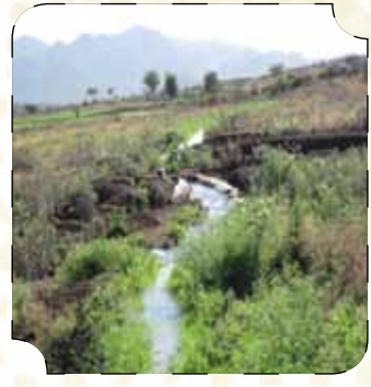
Top: New Bala dam collecting water Bottom: New stream formation for farmland irrigation, pictured during the dry season

As expressed by Reda Tasew, many of the environmental conservation activities described above improve the livelihoods of community members. This is not only because of the PSNP public works program which provide supplementary pay in-kind to laborers. More importantly, many of the same interventions that improve the environment also make it more productive for the men and women who depend on it for their livelihoods. For example the use of closure areas, where grass must be cut and carried to cattle rather than letting them graze freely, allows shrubbery to regenerate in order to provide a more sustainable source of land and food in the long term. Another one of the most successful interventions has been in terms of irrigation. The Bala dam, like others in the area, was constructed about two years ago. Previously, there was no water in the dry season for human or animal consumption, let alone crops. Now, after the dam's creation, there is more ground water and the new formation of many streams throughout the farmlands.