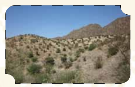
Closure areas demonstrating vegetation growth after 1 year (front) and 2 years (back)

construction. There are nurseries that provide seedlings to farmers, programs to improve and diversify livelihoods, and associations promoting gender and youth empowerment. Finally, roads, bridges and markets have been created to facilitate all of the other community activities. More importantly, all of this has been done in an integrated manner.