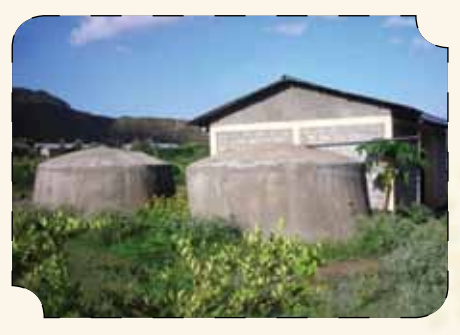
Farmer training center in Raya

Farmers and agricultural workers make up a large segment of the Raya population, and it is especially important to optimize their health in addition to providing livelihood-related services. It is also essential to the PHE approach that they understand the importance of family planning. In Raya, health workers and development agents (DAs) work together to achieve these integrated goals. Farmer training centers in the Raya kebeles give