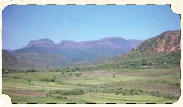
Ebo/Abnet kebele in Raya Azebo woreda

As the PHE Ethiopia Consortium our mission is to "enhance and promote the integration of population, health and environment (PHE) at various levels for sustainable development." We have been striving to fulfill this mission and to provide coordination and capacity building to our members ever since our creation in 2008, in accordance with recommendations following the 2007 "PHE Integrated Development for East Africa" conference. Our organization has since grown in size and responsibility, and we are now involved in a number of activities including enhancing cooperation and networking between government agencies and NGOs, building capacity and increasing PHE resources for members groups, facilitating experience and idea sharing, and organizing advocacy and teaching activities to strengthen awareness and utilization of the PHE approach in Ethiopia. In addition, PHE Ethiopia Consortium is directly involved in several PHE pilot sites throughout the country. One of these sites in the Raya Azebo woreda of the Tigray region is run by the Relief Society of Tigray (REST).