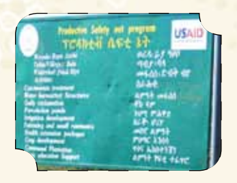
Entrance to the Dibik Biye watershed zone

The overall goals of the Raya project focus on improving livelihoods and food security using interventions targeting health, water, education, women's empowerment, natural resource improvement, irrigation and road construction. The Raya site is also part of the REST and USAID Productive Safety Net Program (PSNP) which means that, due to its chronic poverty, vulnerability and food insecurity, it receives food and money in times of need in addition to other services provided by the watershed program that improve livelihoods and resilience to external stresses like climate change. Furthermore, it is one of two woredas in the PSNP Plus program, which means that community members are provided with additional methods of closing their food gaps, including fattening programs for livestock, and provision of quality cereal packages.