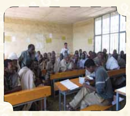
Training for the PSNP Plus livestock fattening program

The community participatory method of achieving developmental goals certainly empowers community members who engage in project activities. This empowerment is increased by clubs, associations and entrepreneurship trainings that bring groups like women and youth together to share ideas and become more productive members of society. In addition, empowerment is promoted by giving people the tools that they need to take risks and to take control of their own lives. One example of this in Raya is their "weather index" crop insurance project in Genete, described