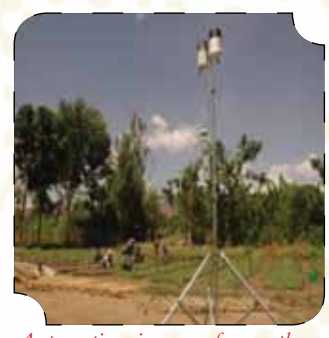
Automatic rain guage for weather index crop insurance

Through its watershed program, REST is working to build better adaptive capacities and infrastructures to protect Raya's rural households from the impacts of climate change. One example of this is their "weather index" crop insurance project, which is an innovative market-based risk-financing system, designed and supported by REST and Oxfam America. This system differs from traditional crop insurance systems in the sense that it depends on rainfall data. If the rainfall in an area is below an agreed threshold, the insurance system compensates farmers. Unlike a traditional crop insurance